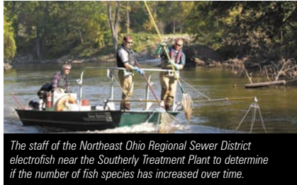
The staff of the Northeast Ohio Regional Sewer District electrofish near the Southerly Treatment Plant to determine if the number of fish species has increased over time.

In contrast with major entertainment sites and other large-scale developments, Cleveland's infrastructure system is the "invisible asset" that works quietly to make Greater Cleveland productive, efficient, safe and environmentally secure. Thanks to the efforts of key BUGC partners, the roads, bridges, waterways, wastewater facilities, public transit and other regional infrastructure assets work hard so the region can work well.