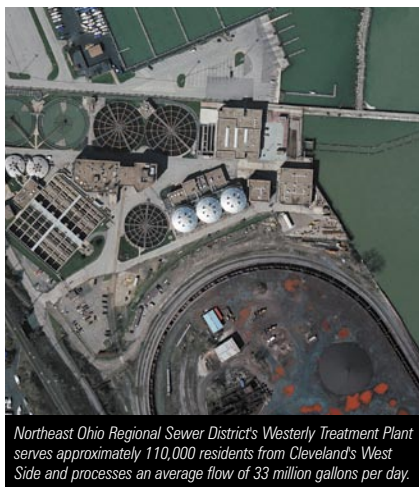
Northeast Ohio Regional Sewer District's Westley Treatment Plant serves approximately 110,000 residents from Cleveland's West Side and processes an average flow of 33 million gallons per day.